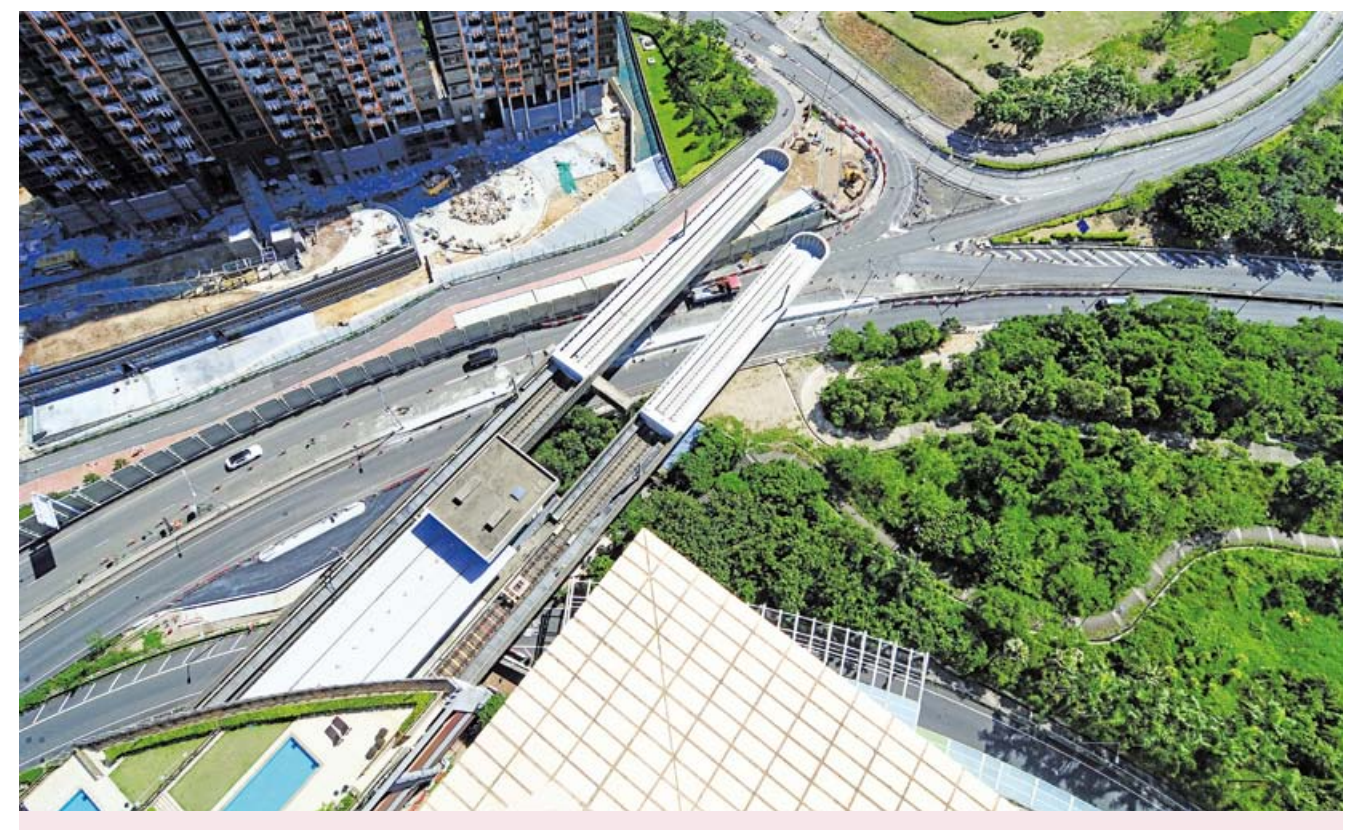
Ma On Shan line modification works for a local railway operator