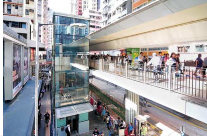
Gloucester Road 告士打道